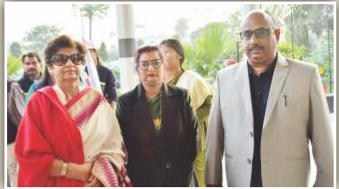
Smt. Sanyukta Bhatia Mayor, Lucknow