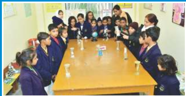
Primary Composite Science Lab